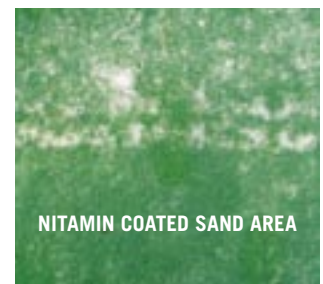
5 MONTHS AFTER APPLICATION

We received quicker germination and it appeared much more of the seed germinated. Compared to the area that only had sand topdressing, the grass was at least twice as thick. It is still obvious where the treated area is after several months. BILL WOMAC, CGCS, BIG CANOE GOLF CLUB